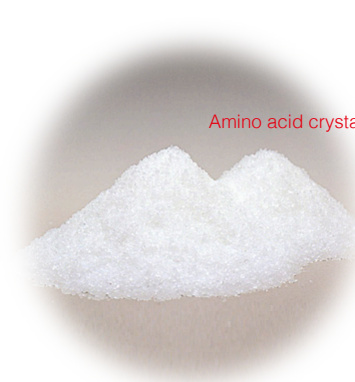
Amino acid crystal